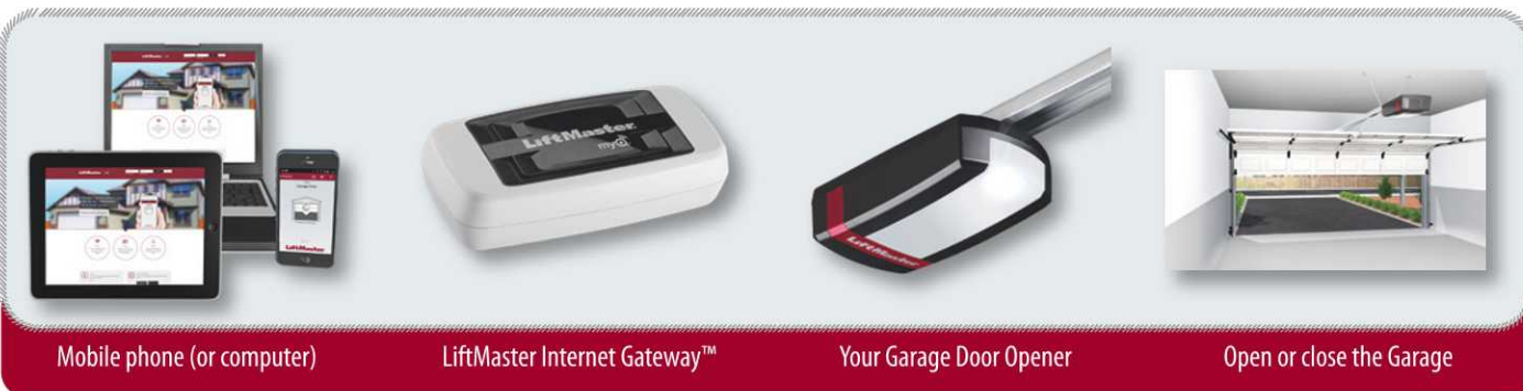
Mobile phone (or computer)